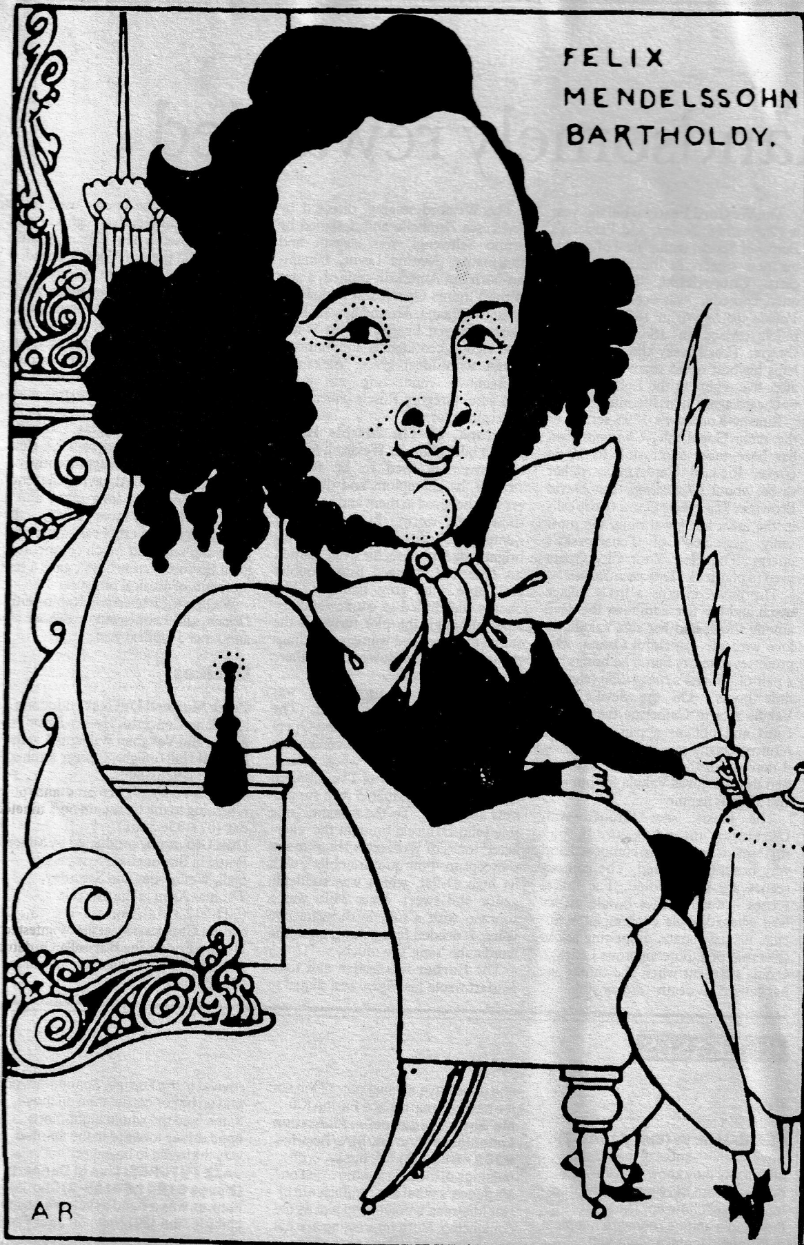
FELIX MENDELSSOHN BARTHOLDY.

A posthumous portrait by Aubrey Beardsley. The composer spent two years in Britain and was more popular here than at home